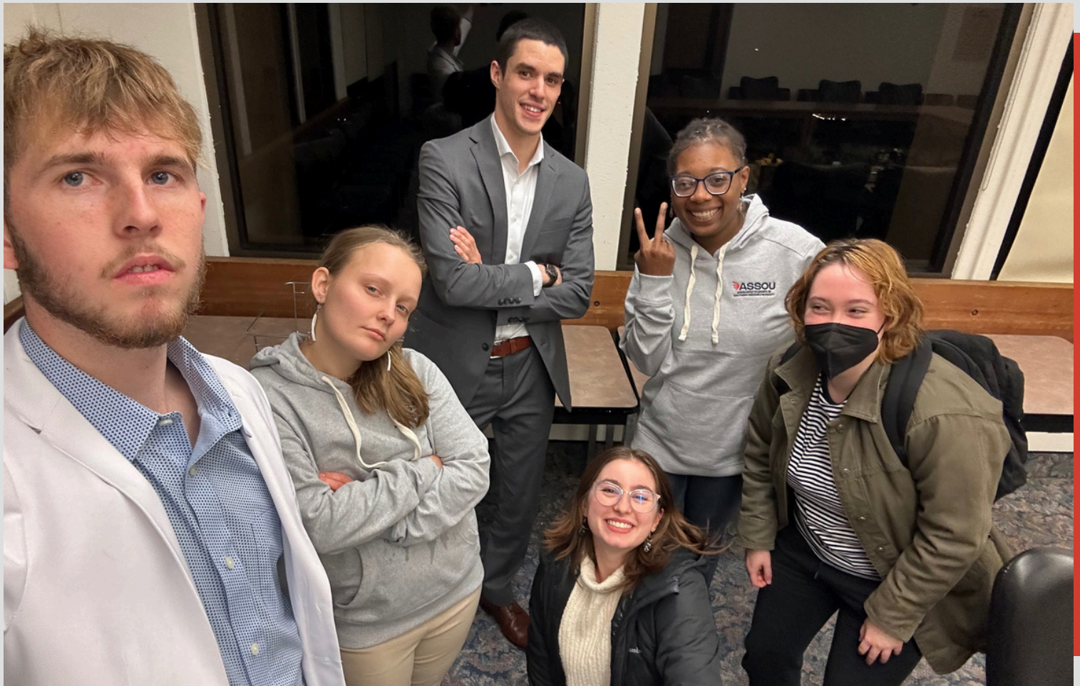
All ASSOU meeting pictured above.