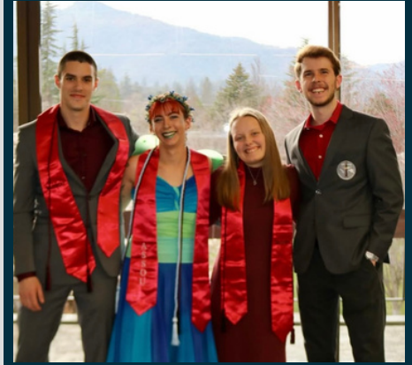
Head of Government: Speaker of the Senate, Vice Speaker of the Senate, Student Body President, and Student Body Vice President.