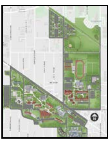
Explore the Campus map here.